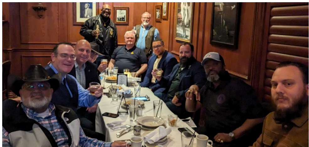
Brothers (and Turtles) from 4 different lodges enjoy fellowship.