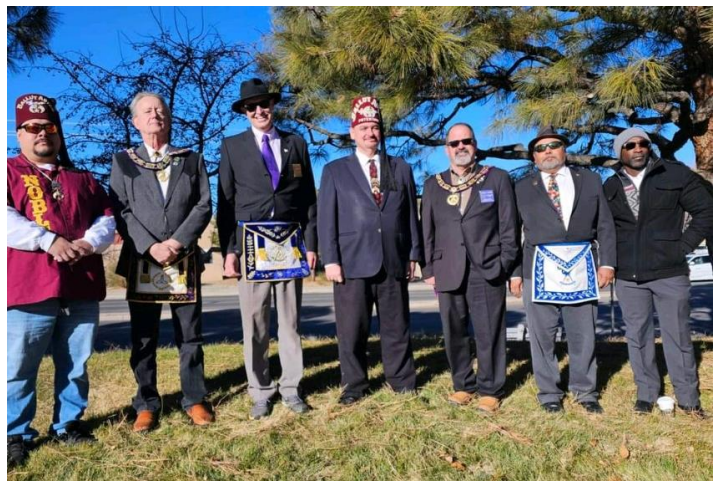
Brothers at the Martin Luther King Remembrance Parade.