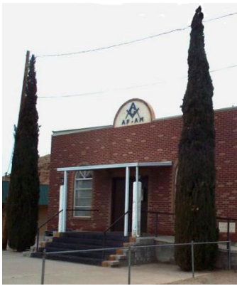
Charles Ford Bethesda Lodge

Bethesda Lodge – the consequences of supporting your community.