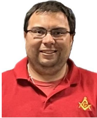
Robert Cowder Valley Lodge

How we walk in our daily lives is a reflection of how others help us grow.