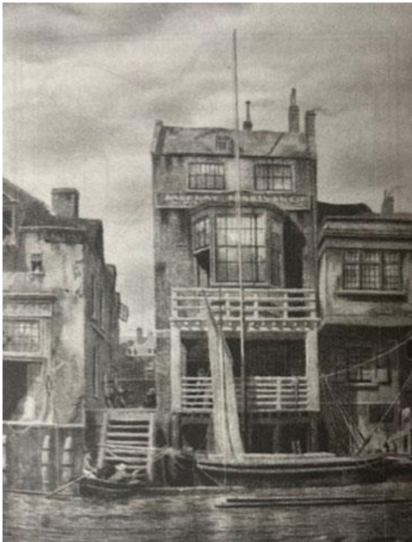
The old Dundee lodge, No.18 (Constituted 1722-23)

I am honored to be numbered amongst you all. Not just because we include in our membership many famous individuals, but because each of us makes up a part of the whole, doing the work that is so desperately needed in this world, for the benefit of all mankind.